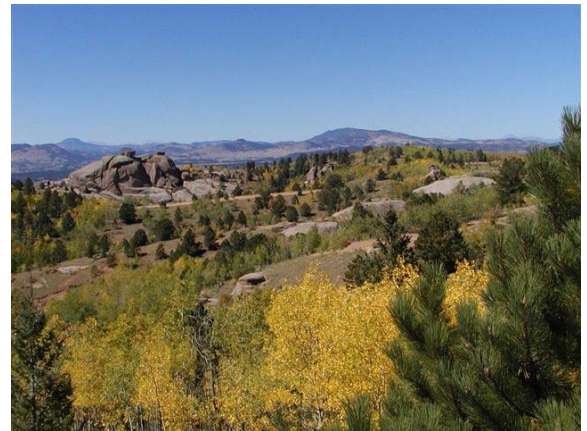
Views and Towering Rock Formations