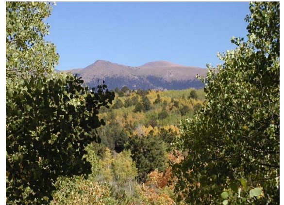
Pikes Peak Views