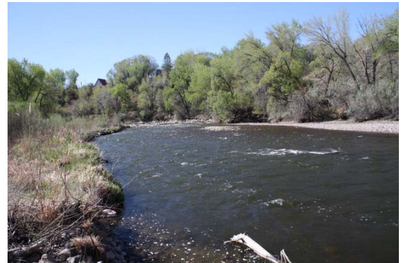
Arkansas River Anyone?