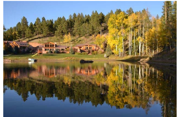
Stocked Fishing Pond