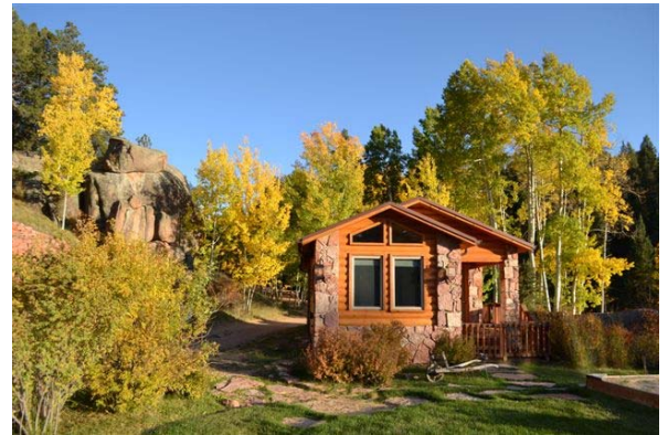
Guest Cabins For Entertaining