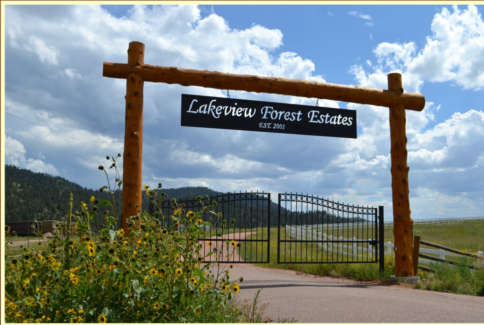
Private Gated Community From Paved County Road