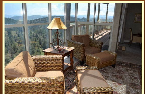
Spectacular Mountain Views From The Sunroom