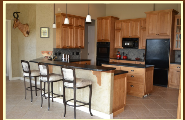
Spacious Open Floor Plan