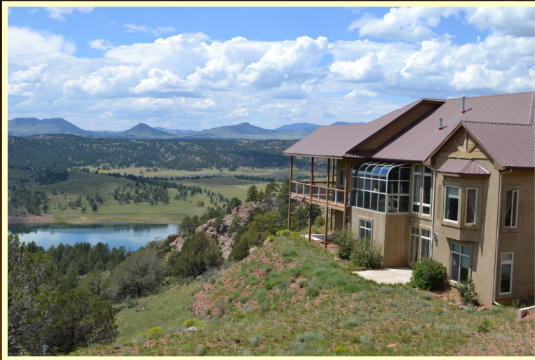
South of Florissant, Colorado (Teller County)