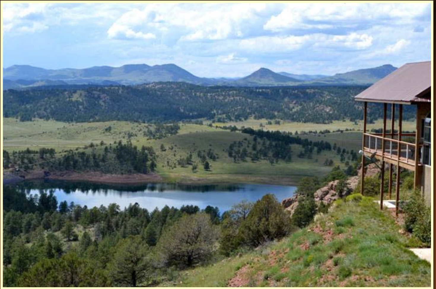
Borders Wright's Reservoir & Private 175 Acres Recreational Lands

52.04 +/- Acres | South of Florissant, Colorado (Teller County)