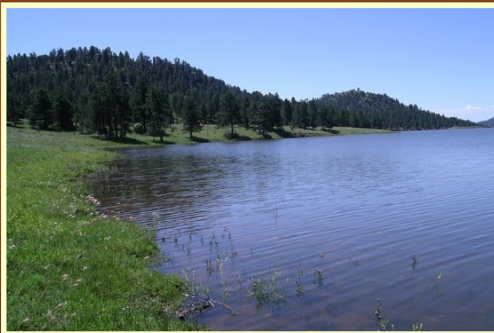
Bordering Stocked Mountain Reservoir