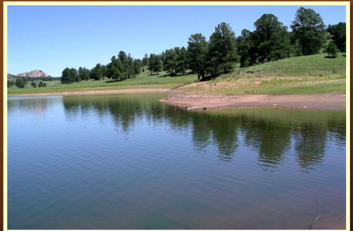
Fishing From The Shoreline